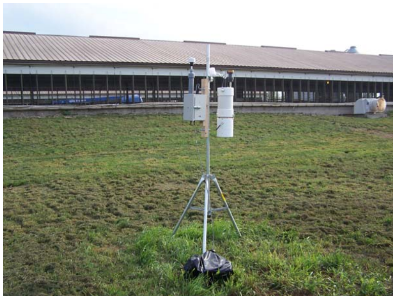
Figure 1. Particle and \text{NH}_3 samplers near pig barn

Based on historical meteorological data, portable \text{PM}_{2.5}/\text{PM}_{10} and \text{NH}_3 samplers were deployed in a generally north-south array in and around the facility. Most of the samplers were deployed on tripod supports at a height of about 2 m above ground level (see Figure 1). Additionally, elevated samplers were placed on a meteorological tower between two of the barns and on a second tower in a cornfield to the north of the facility.