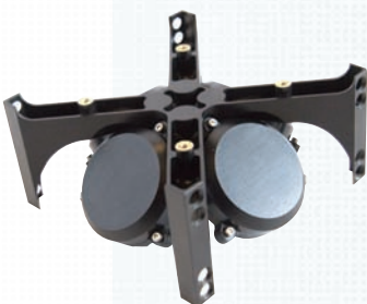
Reaction Wheel Prototype