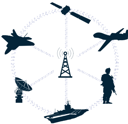
SDL's cybersecurity solutions enable Joint All Domain Command and Control (JADC2)

SDL provides research and development services across the cyber spectrum with an emphasis on complete system cyber resilience. Services range from hardening legacy systems to developing new systems that incorporate the latest in cyber technology.